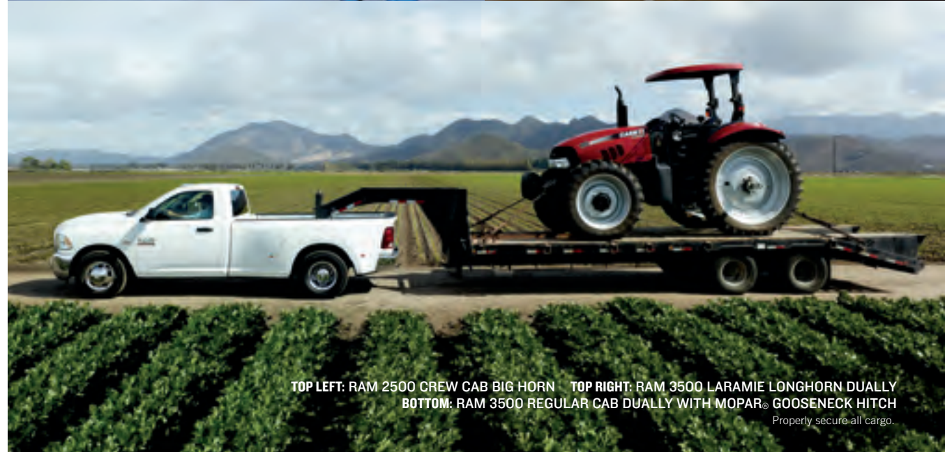
TOP LEFT: RAM 2500 CREW CAB BIG HORN TOP RIGHT: RAM 3500 LARAMIE LONGHORN DUALY BOTTOM: RAM 3500 REGULAR CAB DUALY WITH MOPAR® GOOSENECK HITCH Properly secure all cargo.