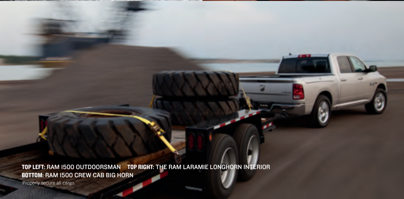
TOP LEFT: RAM 1500 OUTDOORSMAN TOP RIGHT: THE RAM LARAMIE LONGHORN INTERIOR